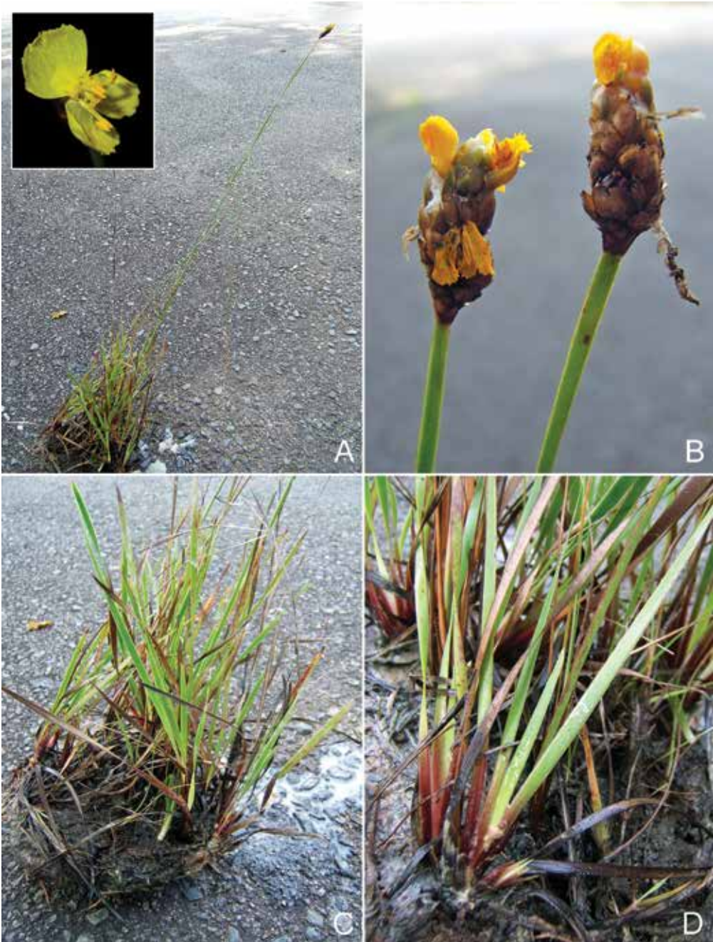
Figure 2. Xyris complanata R.Br. A. Habit (inset: flower). B. Two spikes. C. Leaves. D. Basal part of leaves. (From Singapore, A–D from Tampines; A (inset) from Tampines, Leong et al. SING2008-89 .).