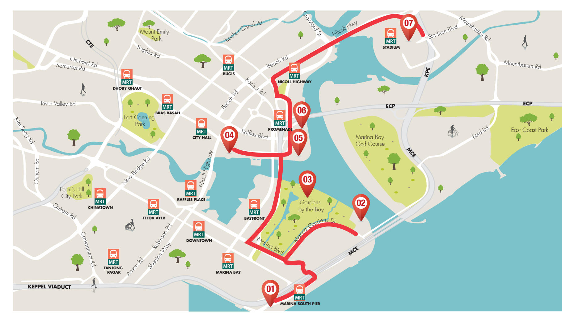
*All projects featured here are either publicly accessible or viewable from street level.

In our heavily built-up city-state with limited land, skyrise greenery helps to create a harmonious balance between urban development and our natural heritage. It also helps reduce the Urban Heat Island effect, making Singapore a more liveable place.