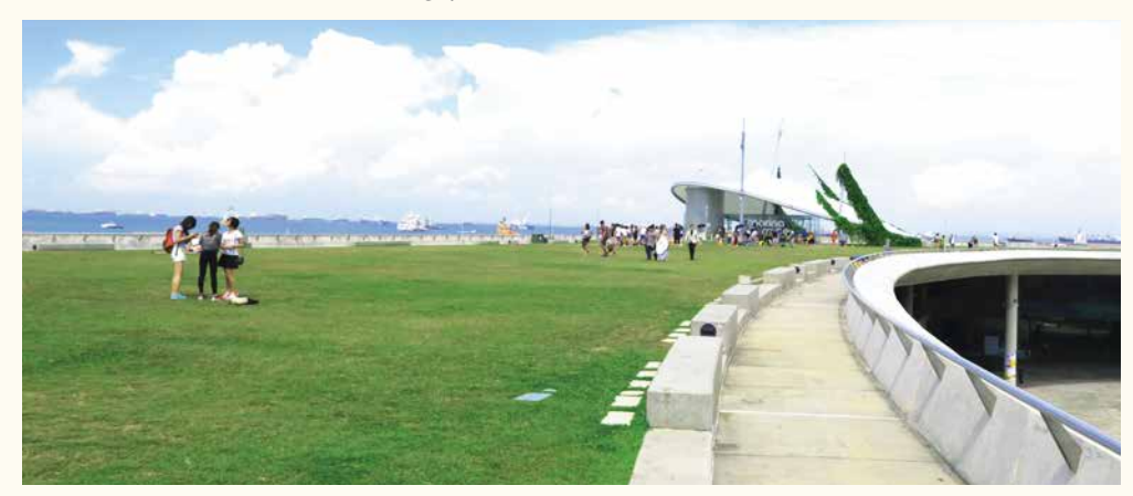
Address: 31 Marina Coastal Drive, Singapore 018988

A sloping lawn of greenery can be found on the topmost deck of this pier. It features a unique design whereby plants are used to form the letters "M P A", which stands for "Maritime and Port Authority of Singapore". The Marina South Pier is owned and maintained by MPA, the agency responsible for the overall development and growth of the port of Singapore. Visitors to this green roof will be treated to panoramic views of the port and the South China Sea.