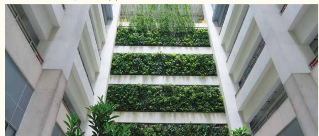
Address: 2 Conservatory Drive, Singapore 117377

This vertical greenery installation is designed to resemble moss-growth on a tiered rock façade, which ties in well with some of the exhibits in the natural history museum. This vertical greenery can be found at the facade facing the campus road. Outdoor exhibits of rooftop greenery displaying vegetation from different eras and habitats can be found along the the perimeter of the upper deck of the building.