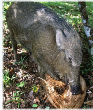
Wild Pig ( Sus scrofa )

The Wild Pig is widespread but difficult to encounter as it usually hides in the forest. Coconut is one of its favourite delicacies. Look on the ground – can you spot its hoof prints?