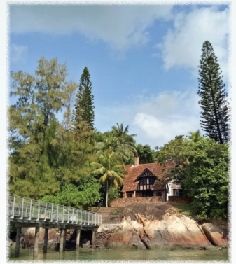
House No.1 - Chek Jawa Visitor Centre

Discover this charming cottage located at one of Singapore's richest ecosystem, Chek Jawa Wetlands.