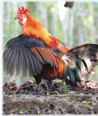
Red Junglefowl ( Gallus gallus )

Do chickens fly? The Red Junglefowl does. Ancestor of the domestic chicken, it is found in only a few places in Singapore, including on Pulau Ubin.