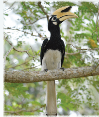
Oriental Pied Hornbill ( Anthracoceros albirostris )

Will you chance upon Singapore's wild population of the Oriental Pied Hornbill? Do you hear its raucous cackling? This magnificent bird nests in tree holes. The female seals itself in the hole to take care of her brood for over two months.