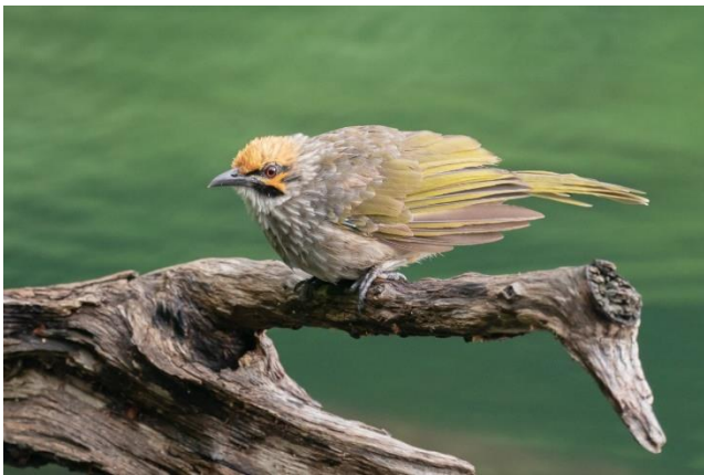
Figure 1. An adult Straw-headed Bulbul in Singapore.

The Straw-headed Bulbul is the largest bulbul in tropical Asia, measuring around 29cm in length and weighing more than 80g (Strange, 2000; Singapore Birds Project, n.d.; Yong et al., 2017; Fishpool et al. 2020). Adults have a golden-yellow forehead, crown, lores, and ear-coverts, with prominent black eye lines and submoustachial stripe (Kumar, 2018; Singapore Birds Project, n.d.; Yong et al., 2017; Figure 1). They also have a whitish throat and greyish-brown nape, mantle, upper back, and breast, with whitish streaks – a pattern that continues down to the abdomen, where the streaks become paler and less striking. Their wings, tail, and rump are olive-green, though the colour is more pronounced in the outer webs of the wing and the upper-tail coverts. Both legs and claws are black.