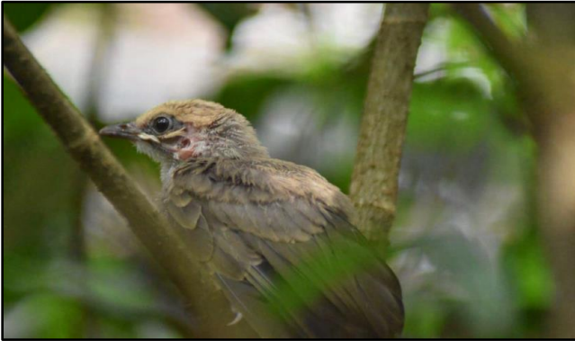
Figure 2. A 15-day old juvenile Straw-headed Bulbul at Singapore’s Jurong Bird Park.

Straw-headed Bulbul chicks have black irises for about six months, before turning dull grey, dull brown, and eventually bright red after about a year and a half (Kumar, 2018).