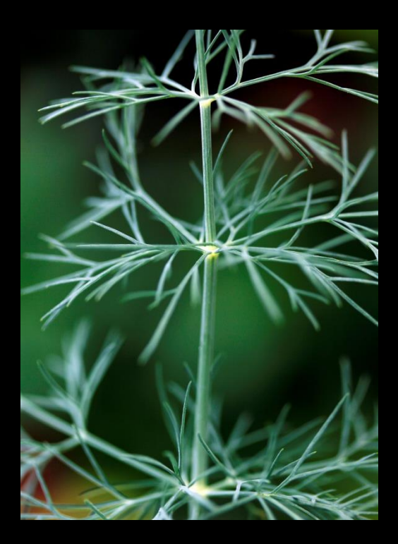
Anethum graveolens (Dill):

The compound leaves are bluish – greyish green, and the leaf stalks have an expanded base that sheaths the stem. The leaflets are attached to leaf stalk at well spaced out intervals