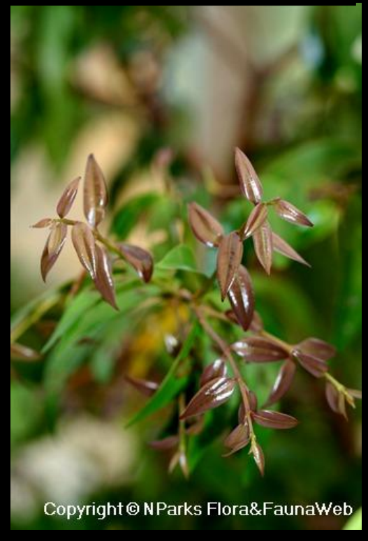
Flush (young) leaves of Syzygium lineatum (left) are a light green, but in Syzygium zeylanicum (right), they are dull red