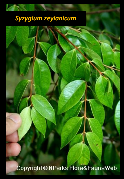
The upper surface of the leaves of Syzygium lineatum (left) are a dull/ matte green, whereas the leaves of Syzygium zeylanicum (right) are glossy