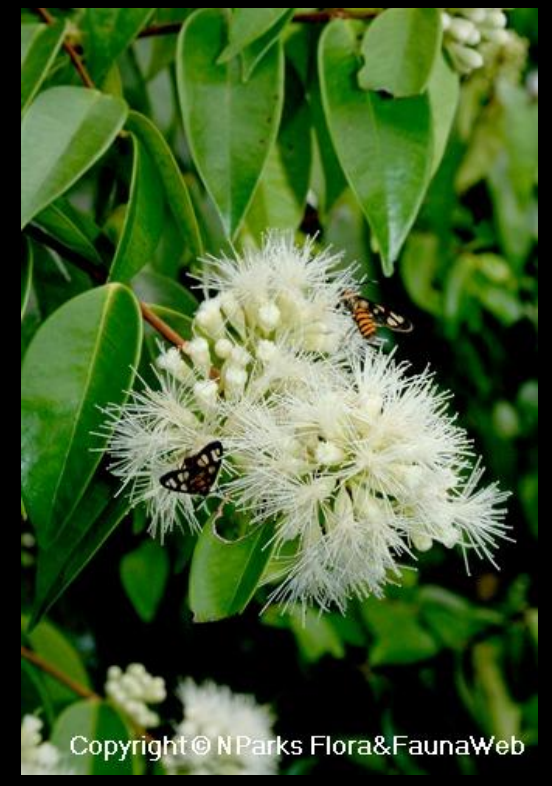
The flowers of Syzygium lineatum (left) are borne on in clusters of up to 10cm long, whereas in Syzygium zeylanicum (right), the flowers are held in more compact clusters of 2.5 - 4cm in length.