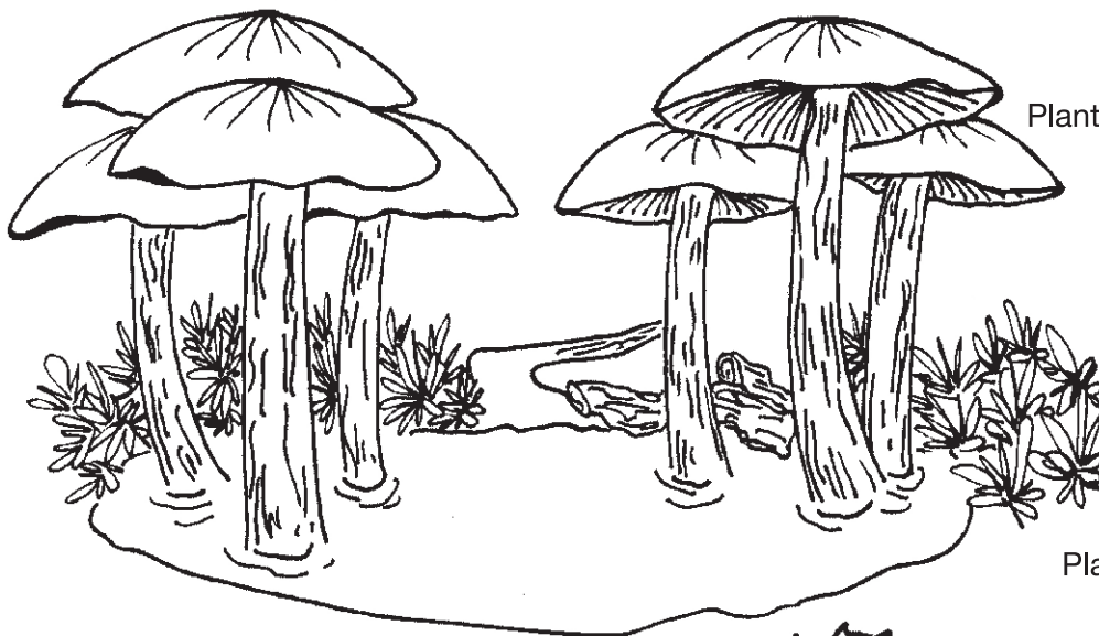
Plants recycle! Do you?