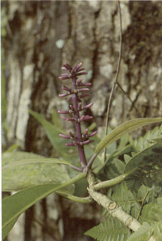
Plate 1. Rennellia elongata in flower (FRI 32013)

A, R. paniculata var. paniculata (3 flowers per head). B, R. paniculata var. condensata (3-6 flowers per head). C, R. speciosa (3-6 flowers per head). D, Rennellia sp. (3-6 flowers per head). E, R. elongata (3 flowers per head). r: inflorescence rachis.