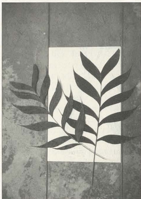
Plate 3. Pinanga paradoxa (Griff.) Scheff., leaves (*H0942).