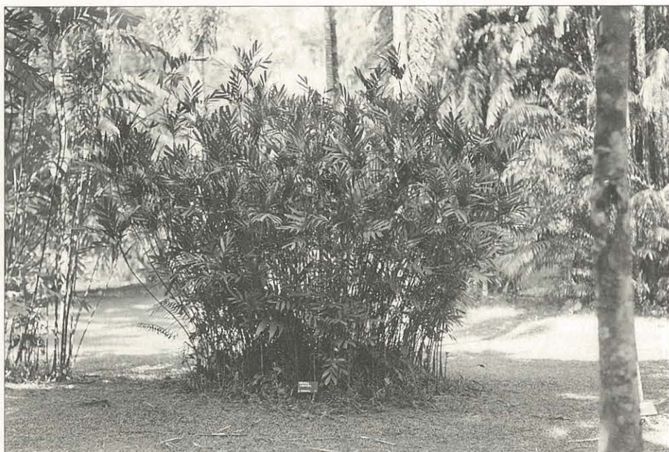
Plate 2. Pinanga riparia Ridley, cultivated in Singapore Botanic Gardens, c.1934.