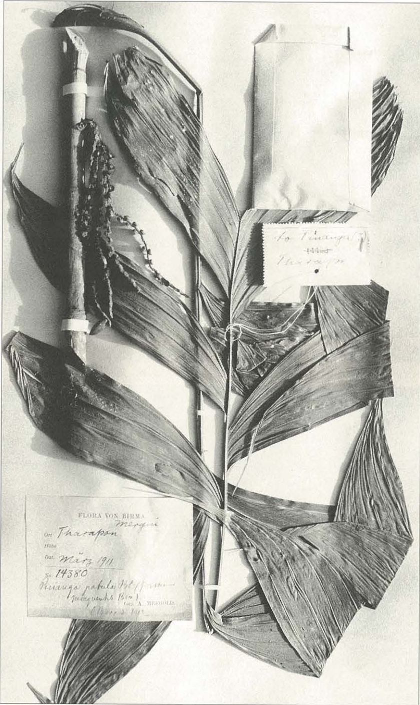
Plate 5. Pinanga auriculata Becc. var. merguensis (Becc. in Martelli) C.K. Lim (holotype: 1911, Meebold 14380, WSRL).