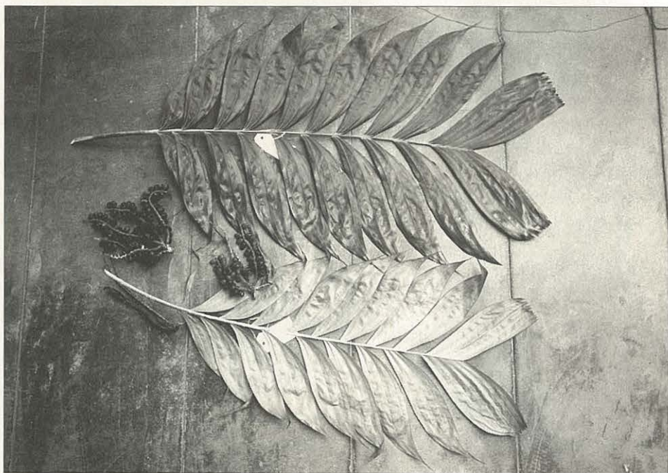
Plate 7. Pinanga auriculata var. merguensis , leaves and fruit (*H1837).