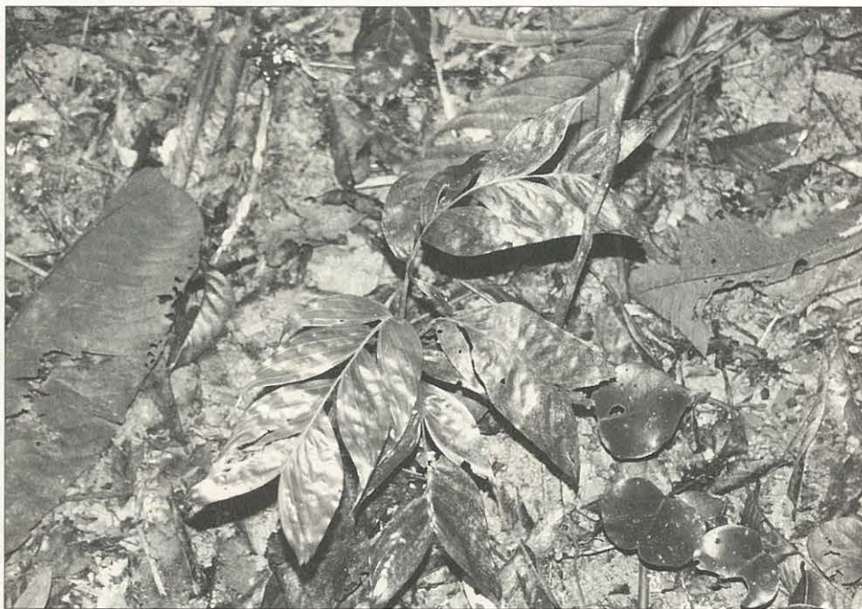
Plate 6. Pinanga auriculata var. merguensis , juvenile leaves.