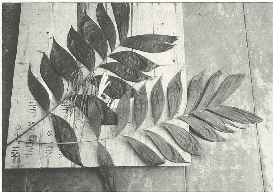
Plate 9. Pinanga auriculata var. leucocarpa , leaves and inflorescence (*H0583).