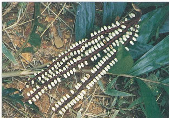
Plate 10. Pinanga riparia , inflorescence and fruit (*H0509).