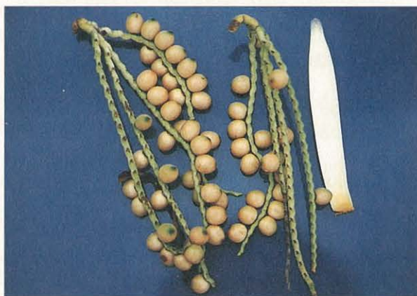
Plate 12. Pinanga auriculata var. leucocarpa , inflorescence and fruit (*H1259).