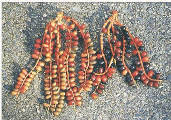
Plate 11. Pinanga auriculata var. merguensis , inflorescence and fruit (*H1837).