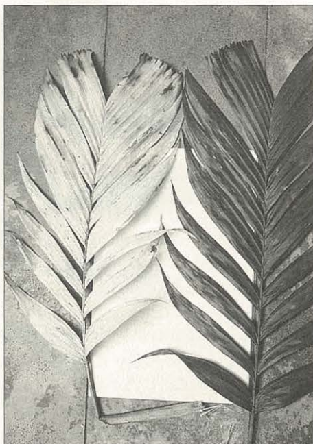
Plate 4. Pinanga riparia Ridley, leaves.