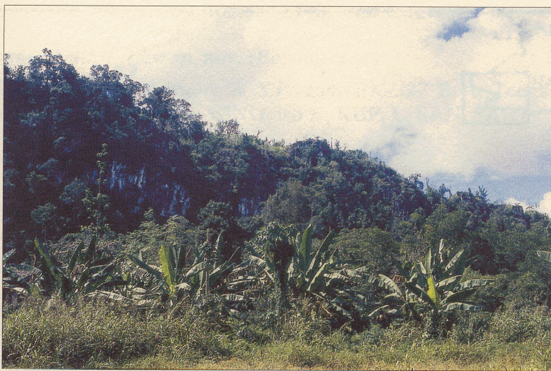
Figure 1. Batu Tengar Cave, Segarong Protected Forest Reserve. (Burnt summit visible to right)