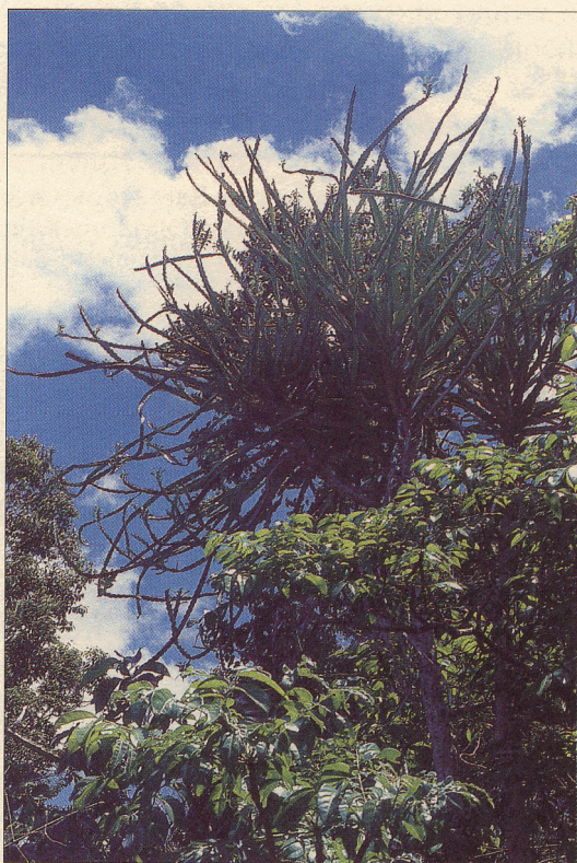
Figure 2. Euphorbia lacei Craib on the summit of Batu Tengar Cave.