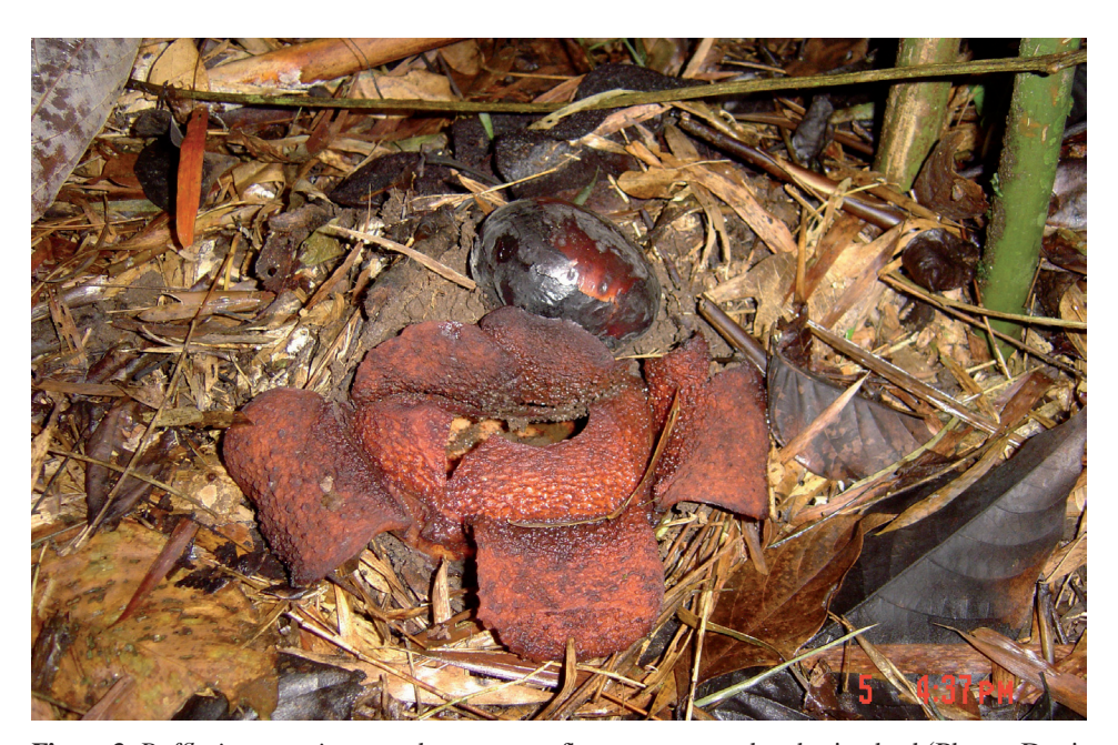
Figure 3. Rafflesia aurantia , an early senescent flower next to a developing bud (Photo: Danilo S. Balete).