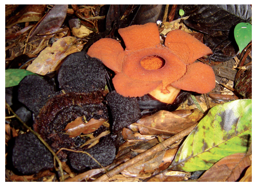
Figure 2. Rafflesia aurantia , a fully expanded flower next to a senescent one.