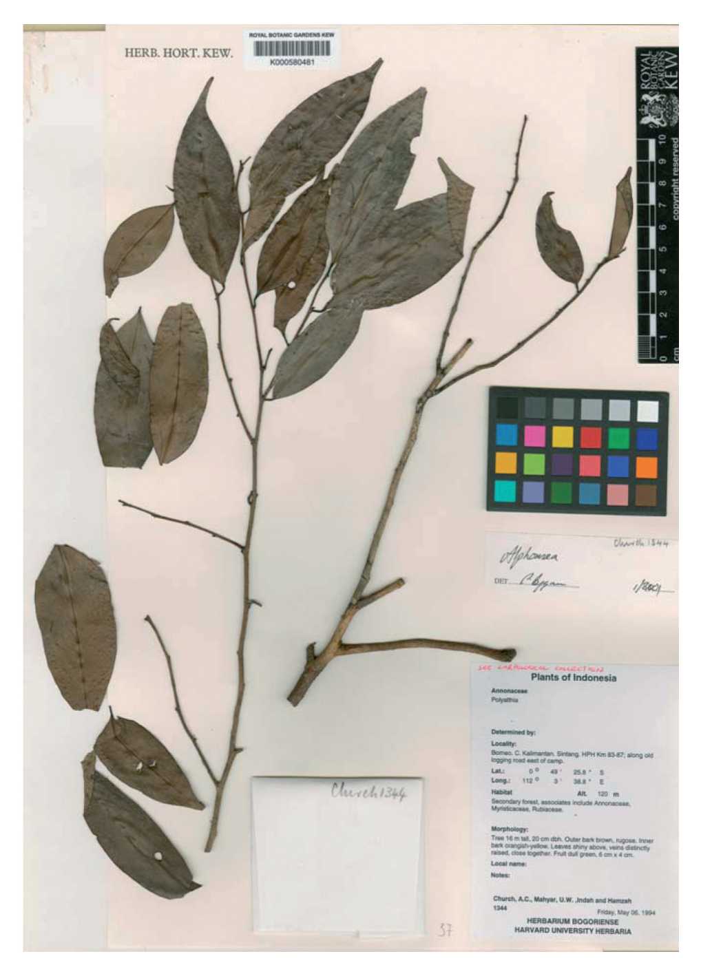
Figure 1. Photograph of the herbarium specimen that forms part of the holotype of Alphonsea borneensis, sp. nov . © The Board of Trustees of the Royal Botanic Gardens, Kew. Reproduced with the consent of the Royal Botanic Gardens, Kew.