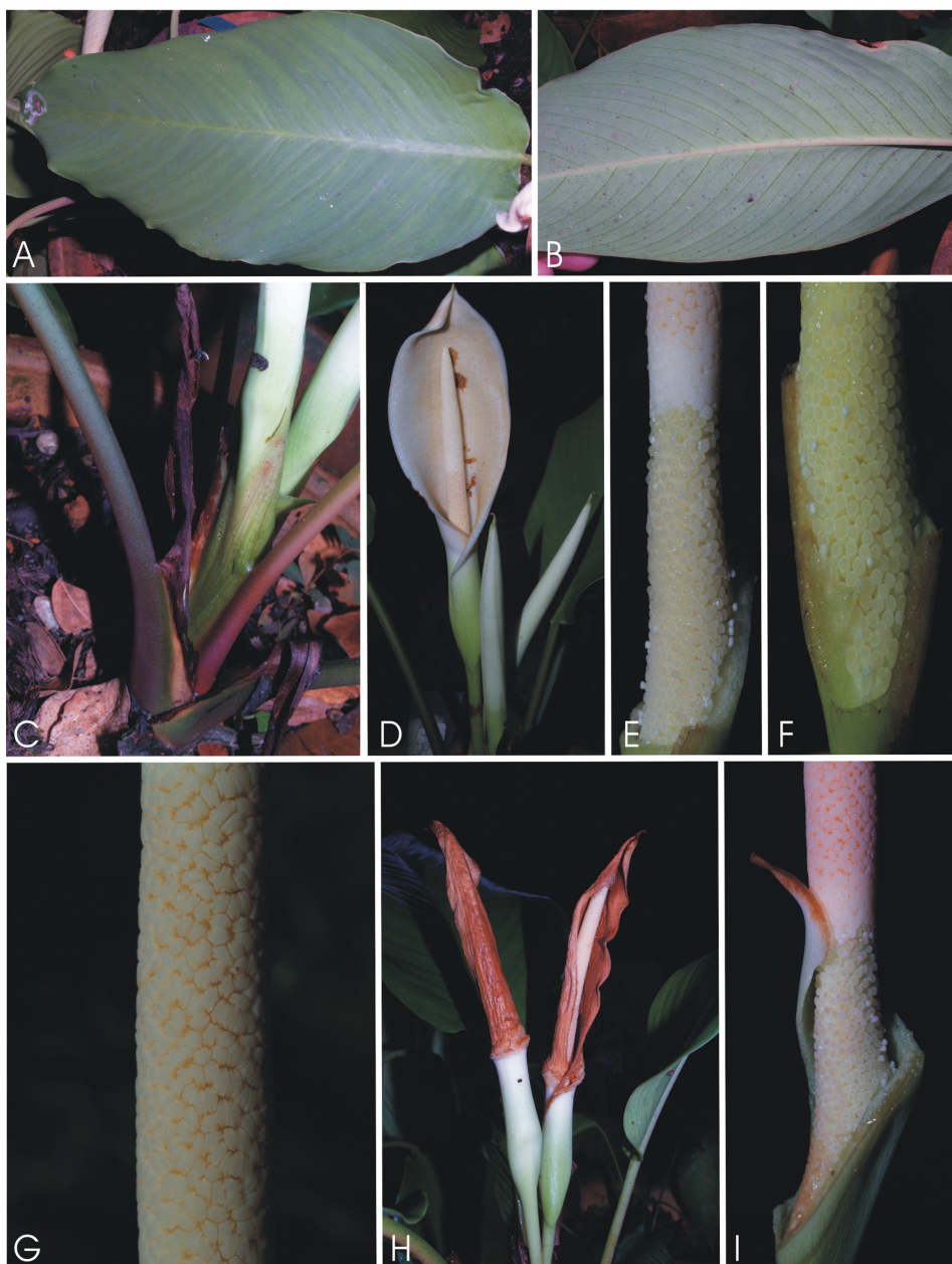
Figure 2. Schismatoglottis dulosa S.Y.Wong. Adaxial (A) and abaxial (B) side of lamina; C. Petiole with marcescent free petiolar sheath; D. An inflorescence at male anthesis with two emerging inflorescences; E & F. Female zone at female anthesis; G. Male zone; H. Spathe limb marcescent; I. Spadix at male anthesis.