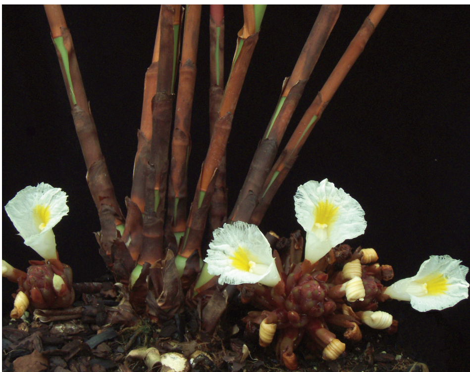
Figure 1. Cheilocostus borneensis ( Poulsen 2696 , cultivated).

Cheilocostus borneensis in inflorescentia radicali C. globoso similis est sed ab eo foliis ad apicem caulis aggregatis plerumque majoribus et calyce molliter acuto (haud pungenti nec aculeato) differt. – Typus: Malaysia, Borneo, Sarawak, Batang Ai, Sungai Senkabang, small stream connecting to Sg. Delok opposite of Ng. Sumpa longhouse, 1°12'S 112°3'E, 130 m, flowering 8 Dec 2002, A.D. Poulsen & Bakir Raymond 1964 (holo, SAR; iso, AAU, Sarawak Biodiversity Centre Flora Depository). Figs. 1 & 2.