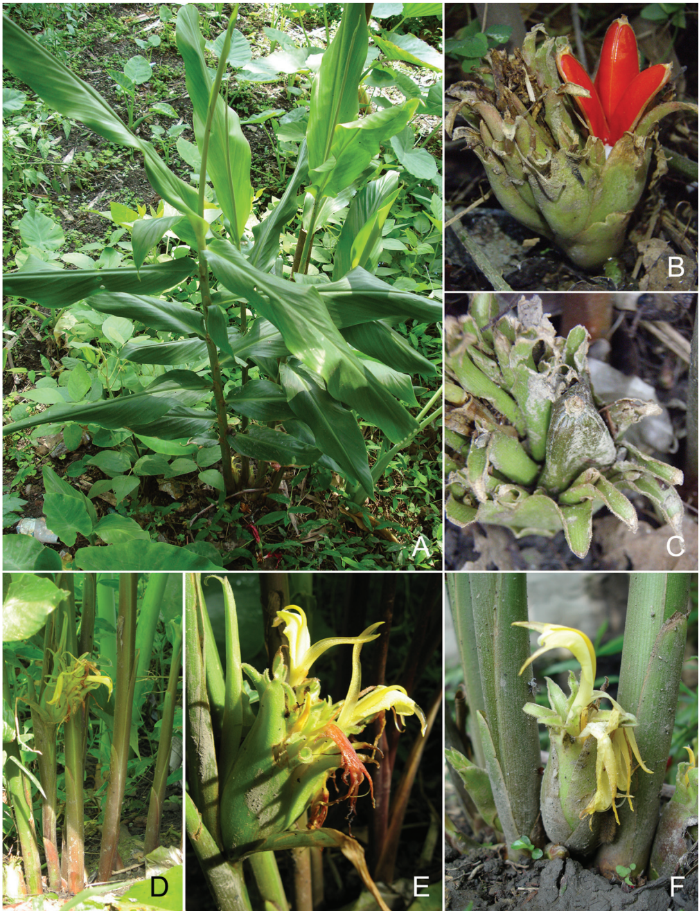
Fig. 2. Zingiber kangleipakense . A. Leafy shoot. B. Inflorescence with mature, opened fruit. C. Inflorescence with closed, not fully matured fruit. D–E. Inflorescence breaking through the leaf-sheaths of pseudostem. F. Inflorescence emerging from the rhizome at the ground level. Based on Kishor 9 . (Photos: Rajkumar Kishor)