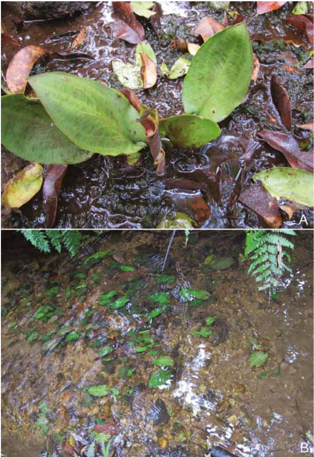
Fig. 2. Cryptocoryne annamica Serebryanyi. A. Emerged growing plant along a stream; note the green, flat leaf blades with red spots and the twisted spathe limb. B. Submersed plants growing in a stream, note the bullate leaf blades.