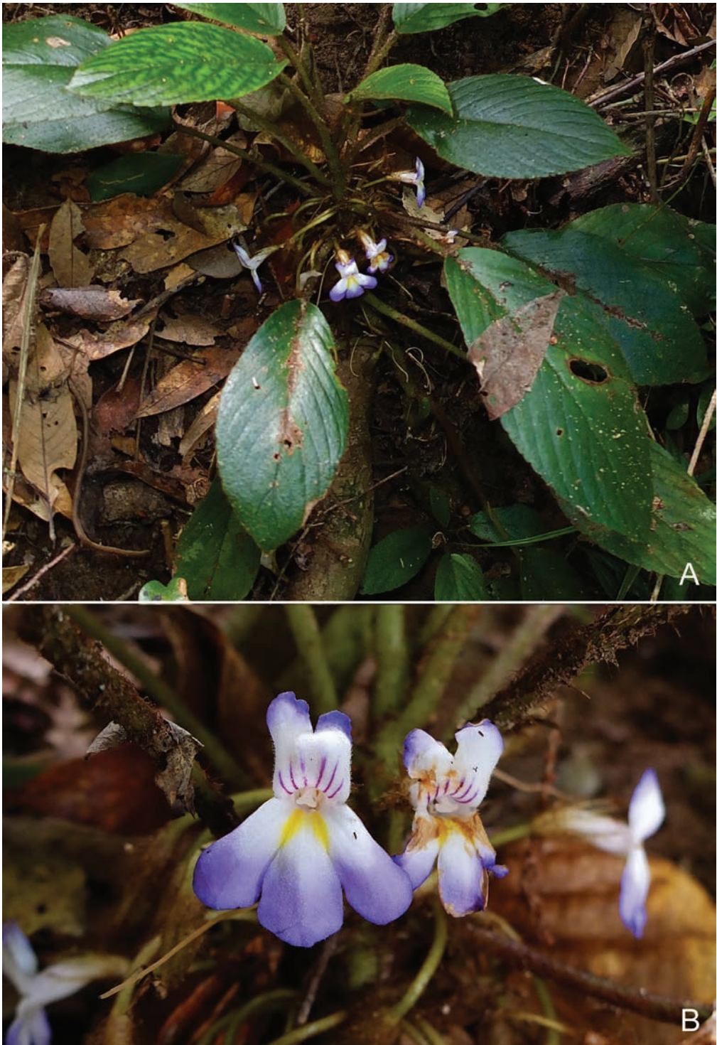
Fig. 1. Billolivia moelleri D.J.Middleton. A. Habit. B. Flowers. From Leong-Škorničková et al. JLS-2623 .