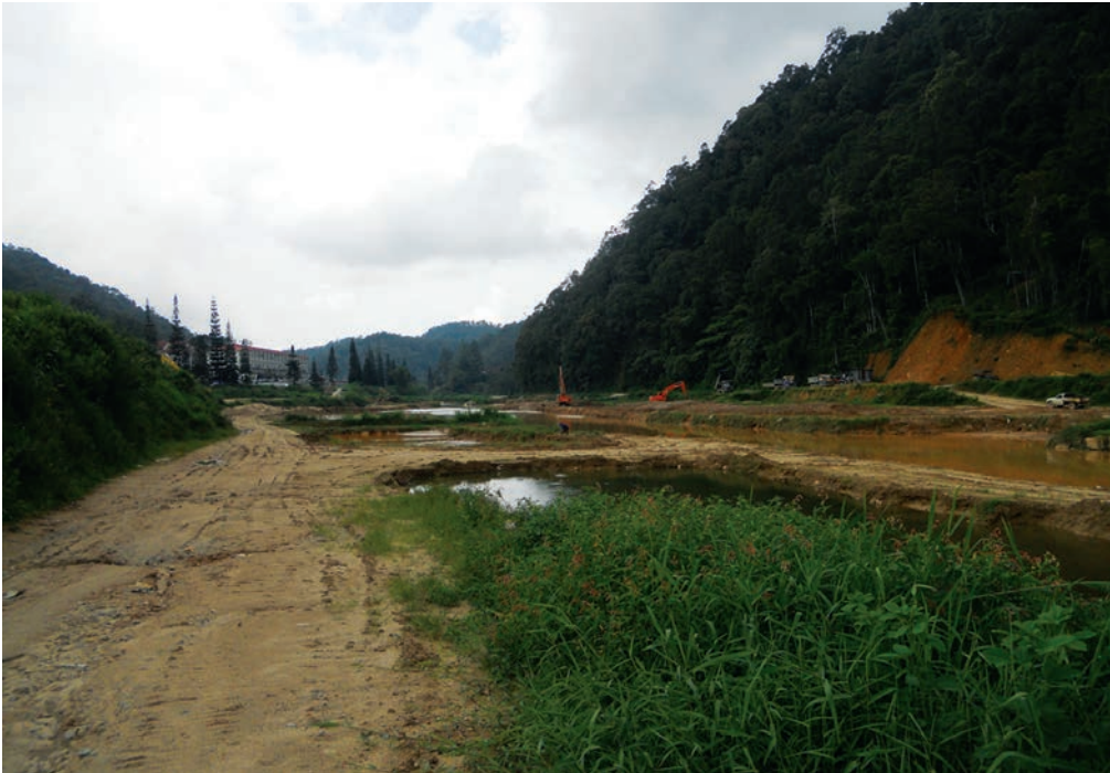
Fig. 2. Habitat of Bothriospermum zeylanicum (J.Jacq.) Druce.

Short-lived herbs with prostrate stems. Stems slender, densely pubescent throughout, much branched, up to 50 cm long. Leaves: petiole short, c. 5 mm long in lower leaves, lacking in the upper; lowermost laminas 20–30 × 6–10 mm, decreasing in size to 4–10 × 2–4 mm in the upper ones, elliptic to lanceolate, margin slightly undulate, densely strigose on both surfaces, base cuneate, midrib impressed above, prominent beneath, apex acute. Pedicels c. 2 mm long. Flowers: calyx green, densely hairy outside; corolla white or very pale purple (in Peninsular Malaysia), c. 2 mm long, lobes 5, longer than the tube, c. 2 mm long, apex broadly rounded, throat appendages white, trapeziform, emarginate, c. 0.2 mm. Stamens 5, included, inserted at the middle of corolla tube, filaments short, anther yellowish turning brown. Ovary green, style less than 1 mm long, terete. Nutlets green turning brown, ellipsoid, to 1 mm long, aperture longitudinally elliptic, surface warty; calyx persistent, c. 3 mm long.