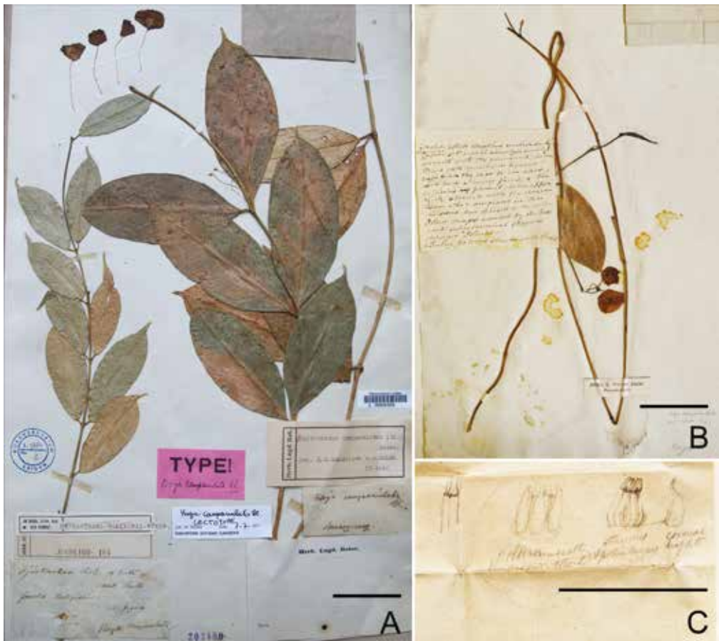
Fig. 3. A. The lectotype of Hoya campanulata in L [L0004389], bearing a label with [Tjunkankan] and [Java] in Blume's hand (label in the lower left corner of the sheet). B. Lectotype of Hoya wallichii in K [K000449753], bearing a [Herb. R. Wight Prop, Presented 1871] label and pencilled [(Wall Asclep. n.) 130]. The large manuscript label is a description of the species attributed to Wight. C. Drawing of the corona of H. wallichii found on the lectotype (Visible folded in the upper right corner of Fig. 3B). Scale: 5 cm.