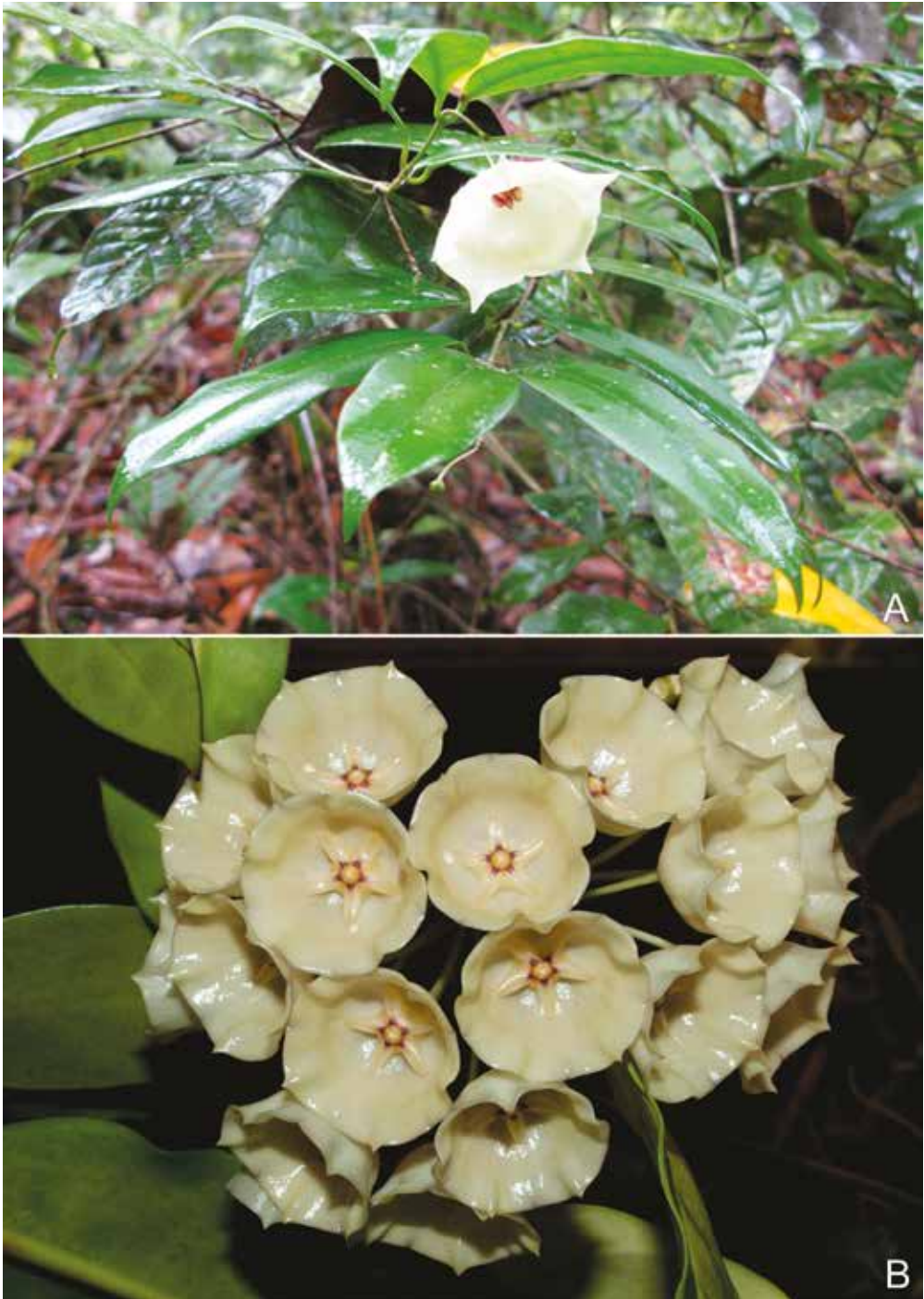
Fig. 1. Comparison between the inflorescences of Hoya wallichii and H. campanulata. A. Hoya wallichii in situ in Brunei, with a single flower. B. Hoya campanulata, cultivated at the Singapore Botanic Gardens, with an umbelliform inflorescence.