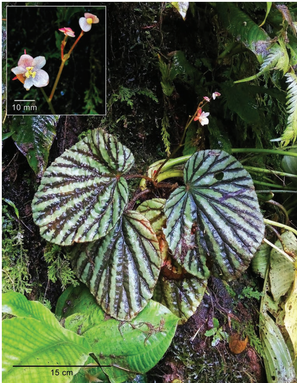
Fig. 2. Habit of Begonia promethea Ridl. in Bengkayang, West Kalimantan (inset: inflorescence showing basal female flower and distal male flowers). All from WEKBOE 185 .

Habitat. Lowland forest at 50–150 m elevation, growing on wet, shaded and almost vertical sandstone cliffs (Buso) or basalt cliffs with water spray, sometimes in direct sunlight (Berawat'n Waterfall). Very local but can densely cover the rock face in small