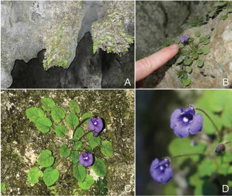
Fig. 4. Petrocosmea martini (H.Lév.) H.Lév. A. Habitat. B. Habit, with author's finger for scale. C. Plant in flower. D. Corolla viewed from the front. (Photos: F. Wen).

Distribution. Only known from the type locality, a large limestone cave, near Tiandong Village, Langping town, Tianlin County, Baise City, Guangxi Zhuangzu Autonomous Region, China (Fig. 2A).