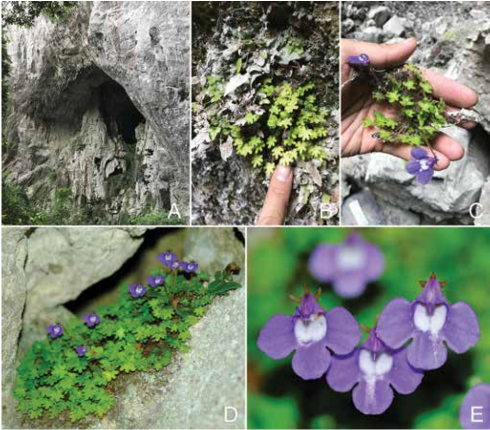
Fig. 2. Petrocosmea weiyigangii F.Wen. A. Habitat. B. Habit, with author's finger for scale. C. Relative size of the adult plant with author's hand for scale. D. Colony of flowering plants. E. Corolla viewed from the front. (Photos: F. Wen).

Perennial, stemless, rosulate herb. Rhizome extremely short, inconspicuous. Leaves inconspicuously spiral, 21 to 30 per plant, petioles subterete, 20–45 mm long, 0.8–1 mm in diam., brown, densely puberulent; leaf blades herbaceous when dried, ovate to rounded, slightly asymmetric to symmetric, 12–15 × 10–12.5 mm, base cordate and truncate, margin deeply lobed, lobes 2–3 on each side of blade, each lobe narrowly oblong to oblong, apices obtuse to nearly rounded, 2–3-veined, adaxially and abaxially glabrous. Inflorescences axillary, cymes usually 1-flowered; peduncle 35–50 mm long, densely eglandular-pubescent to pilose; bracts 2, free and opposite, ensiform, 2–3 mm long but usually caducous or withered before anthesis; pedicels 6–10 mm long, pubescent. Calyx nearly actinomorphic, equally divided into 5 lobes, with outer surface sparsely pubescent and inner surface nearly glabrous; lobes equal, broadly lanceolate, 6.5–8 × 3.5–5 mm, margin entire, apex acute. Corolla purple, throat white, sparsely pubescent outside, glabrous inside; tube c. 9 mm long; adaxial