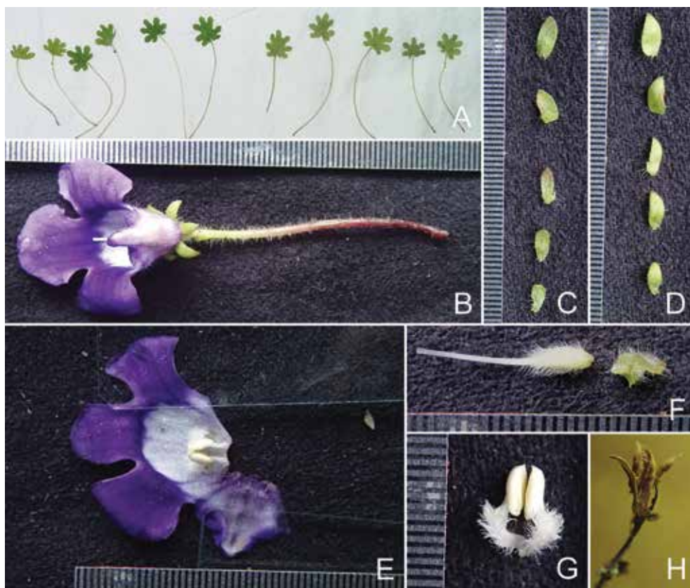
Fig. 3. Petrocosmea weiyigangii F.Wen. A. A variety of leaves. B. Flower viewed from the top. C. Abaxial surfaces of calyx lobes. D. Calyx lobes, adaxial surfaces. E. Corolla, opened up to show stamens and staminodes. F. Pistil (Style, ovary and disc). G. Stamens with glabrous anthers and white pilose filaments. H. Mature dehiscent capsule. (Photos: F. Wen).

lip c. 6.5 mm long, indistinctly 2-lobed with the two small lobes fused for almost their entire length and each lobe folded and rolled laterally to form a carinate-plicate (galeate) structure that encloses the style; abaxial lip c. 19 mm long, 3-lobed to the middle, with oblong to semicircular lobes. Stamens 2, c. 10 mm long, adnate to the base of the corolla tube; filaments c. 6 mm long, geniculate near the middle with an angle of about 150°, white pilose from the base to the middle; anthers ovate, c. 3.6 mm long, poricidal, glabrous, dorsifixed, coherent at apex; staminodes 3, adnate to the corolla tube at the base, glabrous. Disc greenish yellow, annular, glabrous, c. 1.5 mm high. Pistil c. 16 mm long; ovary densely white villous, ovoid, c. 5.5 mm long; style semitransparent to white, c. 10.5 mm long; stigma punctiform, white. Capsules straight in relation to pedicel, brown, long ellipsoid, 5–6 mm long, both loculicidally and septucidally dehiscent.