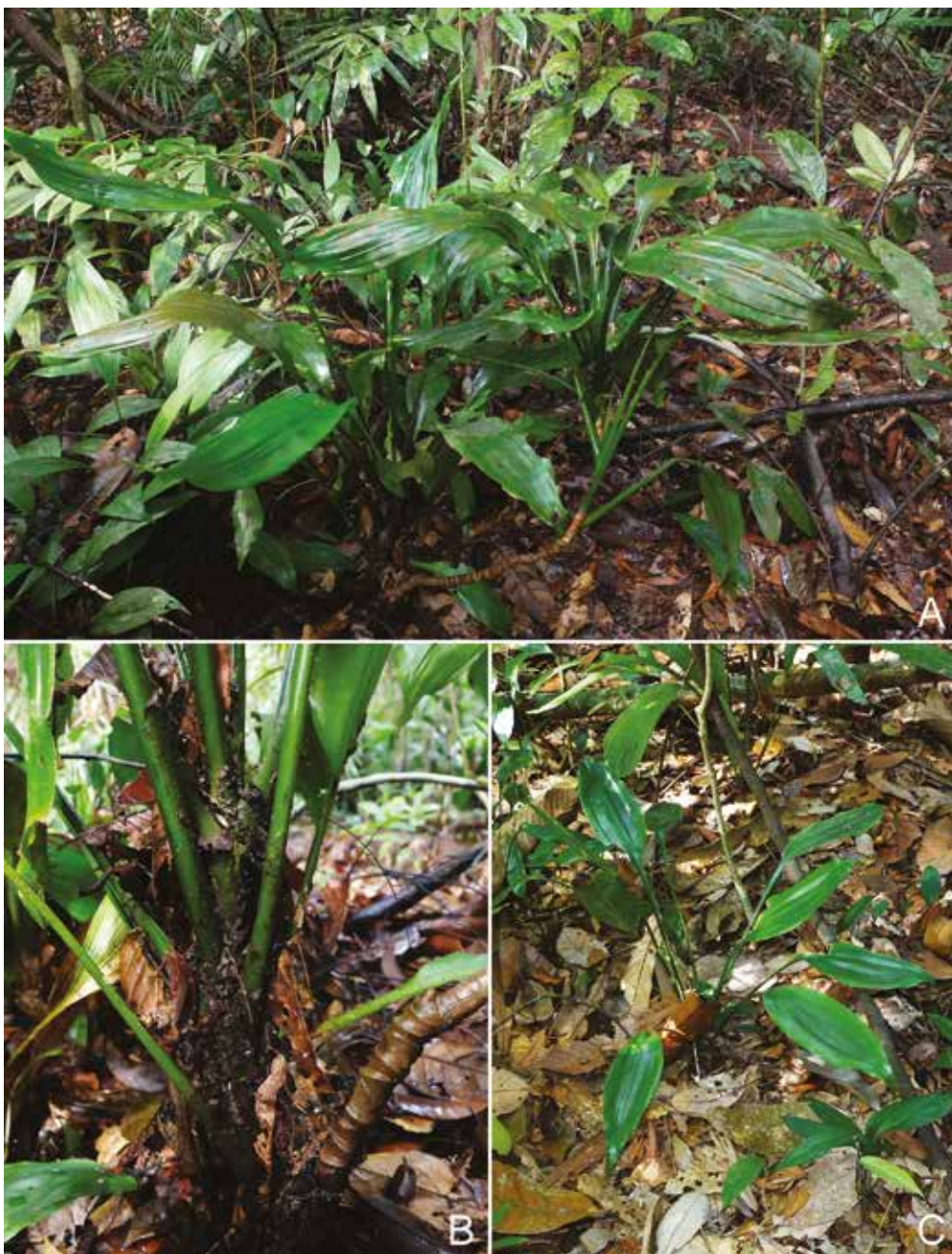
Fig. 1. Dracaena breviflora Ridl. A. Habit of mature plant. B. Basal part of young stem showing accumulation of humus among the pseudopetioles (left) and old leafless stem (right). C. Habit of young plant. A, B from Seletar, Niissalo & Leong-Škorničková DRA-12; C from Nee Soon.