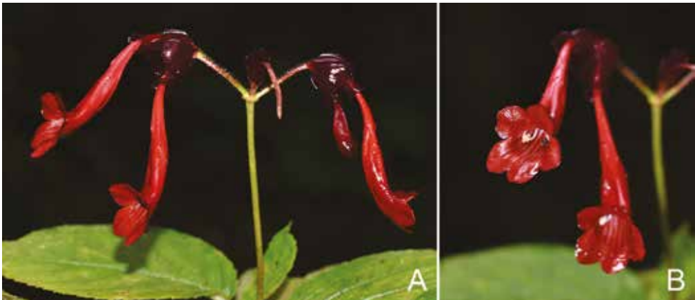
Fig. 3. Didymocarpus formosus Nangngam & D.J.Middleton. A. Inflorescence. B. Flowers.