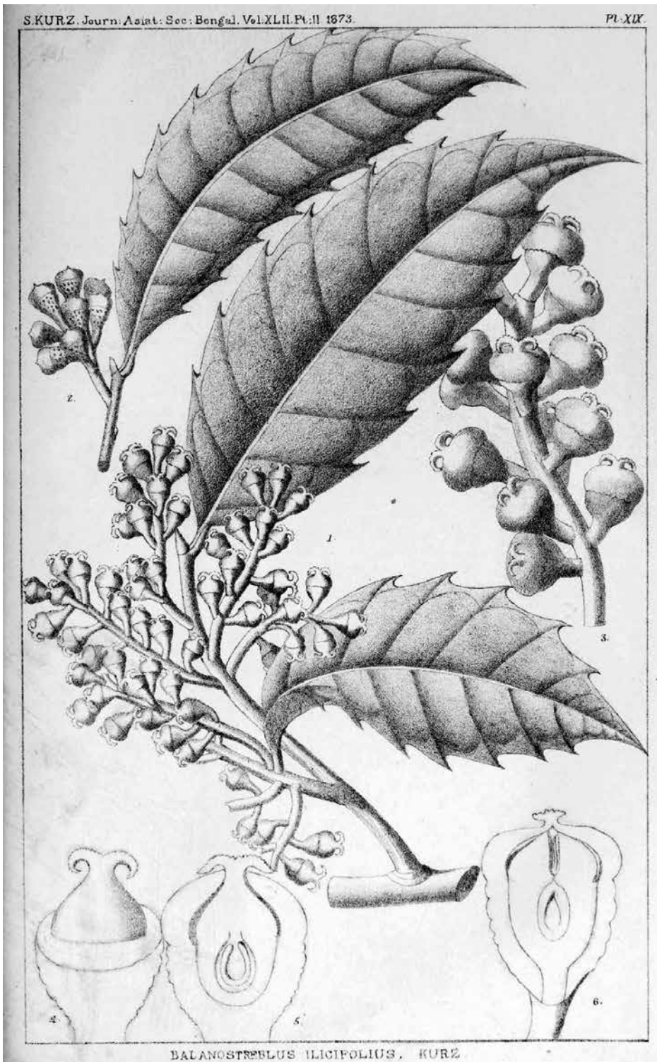
Fig. 1. The illustration accompanying Kurz's protologue.