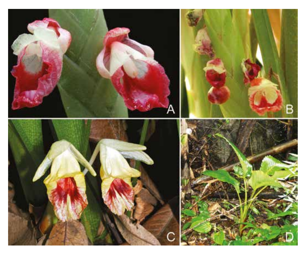
Fig. 2. A, B. Boesenbergia albomaculata S.Q. Tong. C, D. Boesenbergia kerrii Mood, L.M. Prince, & Triboun. A from Kress, J.W. 02-7056 ; B from Kress, J.W. 00-6815 ; C & D from Mood, J. & Triboun, P. 12P170 .

bracts 4–6, cymbiform, distichous, 5–6 cm long, white (below ground), green and red (above ground), apex curved; bracteole lanceolate, c. 5 \times 0.5 cm, white, translucent, glabrous. Flowers c. 16 cm long; calyx tubular, 20 \times 5 mm, white, translucent, apex bidentate; floral tube 12–14 cm long, c. 3 mm diam., white, glabrous; corolla lobes linear to lanceolate, c. 2 \times 0.5 cm, white to light yellow, mostly glabrous, margins involute; androecial cup 4–5 mm long, oriented 90^{\circ} to the floral tube, throat glabrous; labellum saccate, semi-orbicular, 3.8–4 \times 2.2 cm, light yellow, throat centre orangered, maculate with yellow showing through as dots, c. 5 mm wide at base, broadening toward the margins, ending c. 10 mm short of the apex, then dark red streaks to the apex, margin entire, revolute on the sides, apex shortly to deeply bilobed, lobes 2–8 mm long, slightly wavy; lateral staminodes obovate, c. 1.3 \times 1 cm, light yellow, apex rounded, revolute, margin wavy, dorsal surface with few glandular hairs; Stamen c. 1.1 cm long, scattered glandular hairs full length, apex slightly bilobed, filament 2 \times 2 mm, light yellow; anther c. 9 \times 3 mm (first day), c. 6 mm wide (second day), thecae