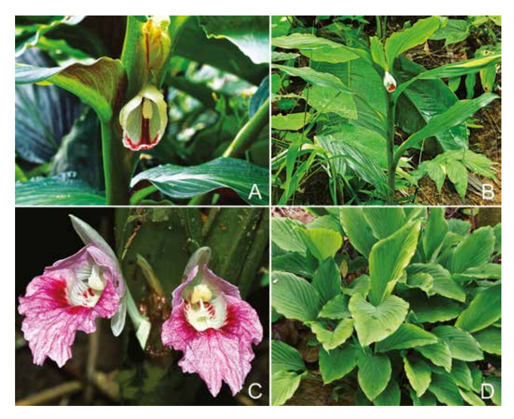
Fig. 5. A, B. Boesenbergia pulcherrima (Wall.) Kuntze. C, D. Boesenbergia rotunda (L.) Mansf. A & B from Mood, J. & Vatcharakorn, P. 3363 ; C & D from Mood, J. & Vatcharakorn, P. 3037 .

Often the abaxial lamina surface is red or purplish. The inflorescence is partially hidden by the two upper leaf sheaths, although may sometimes be more exserted as depicted in the lectotype (icon). The red and white flowers are very similar to Boesenbergia parvula , but larger.