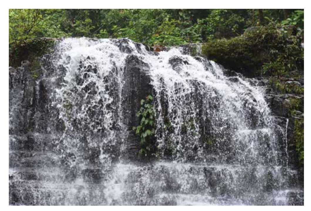
Fig. 2. Steenisian rheophyte. Heteroaridarum borneense on a granite-intruded sandstone waterfall. Water flow depicted is typical for much of the year. (Photo: P.C. Boyce).