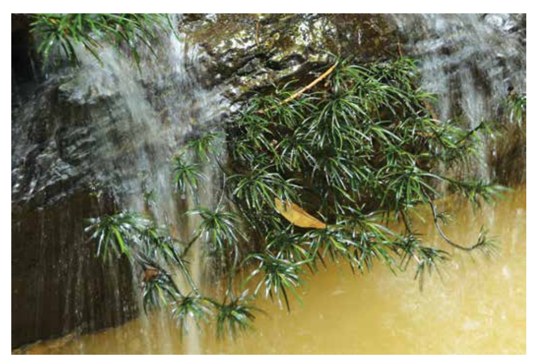
Fig. 6. Extreme rheophyte. Aridarum chamaesyce on a shale cascade. Photograph taken during dry season.