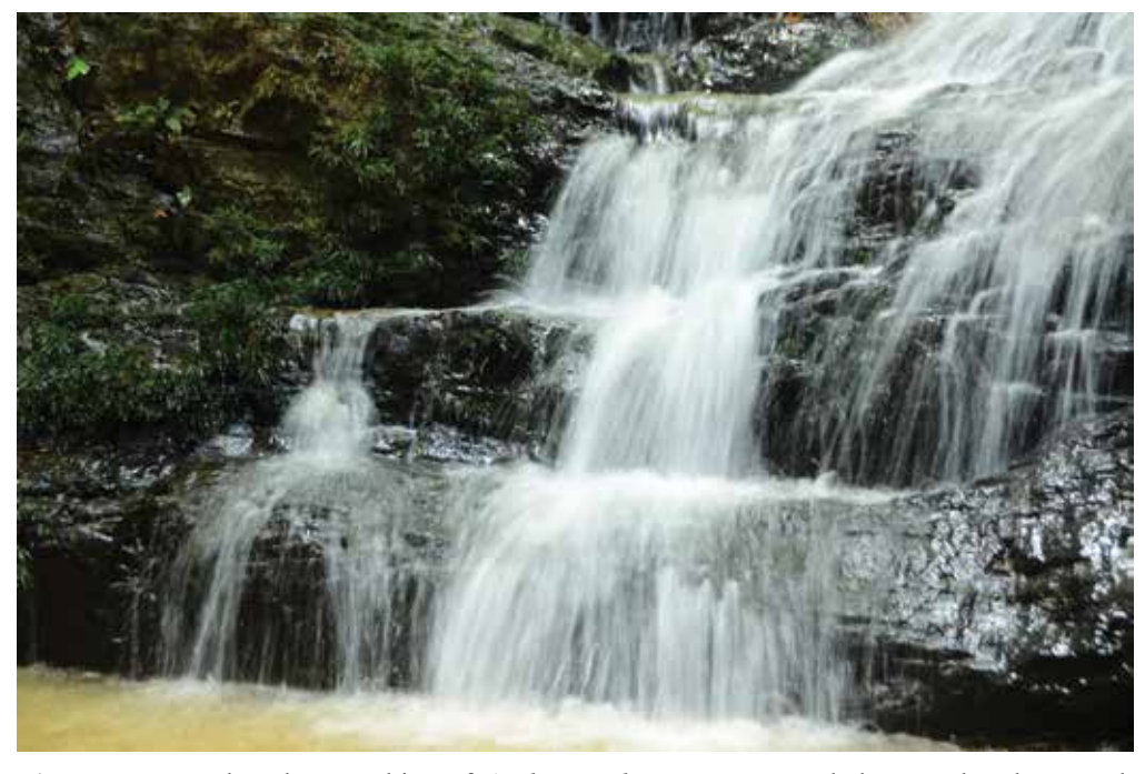
Fig. 7. Extreme rheophyte. Habitat of Aridarum chamaesyce on a shale cascade. Photograph taken during dry season. (Photo: P.C. Boyce).