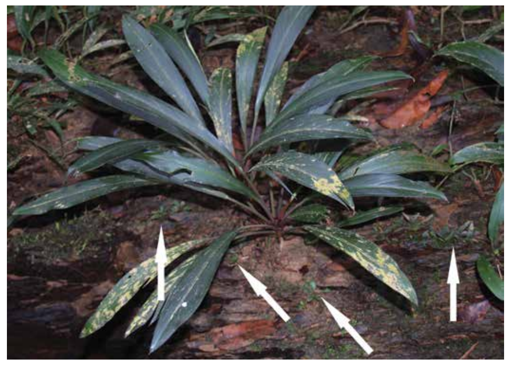
Fig. 8. Vegetative rheophyte. Gamogyne burbidgei on Setap shales, with adventitious plants arising from roots indicated by white arrows.