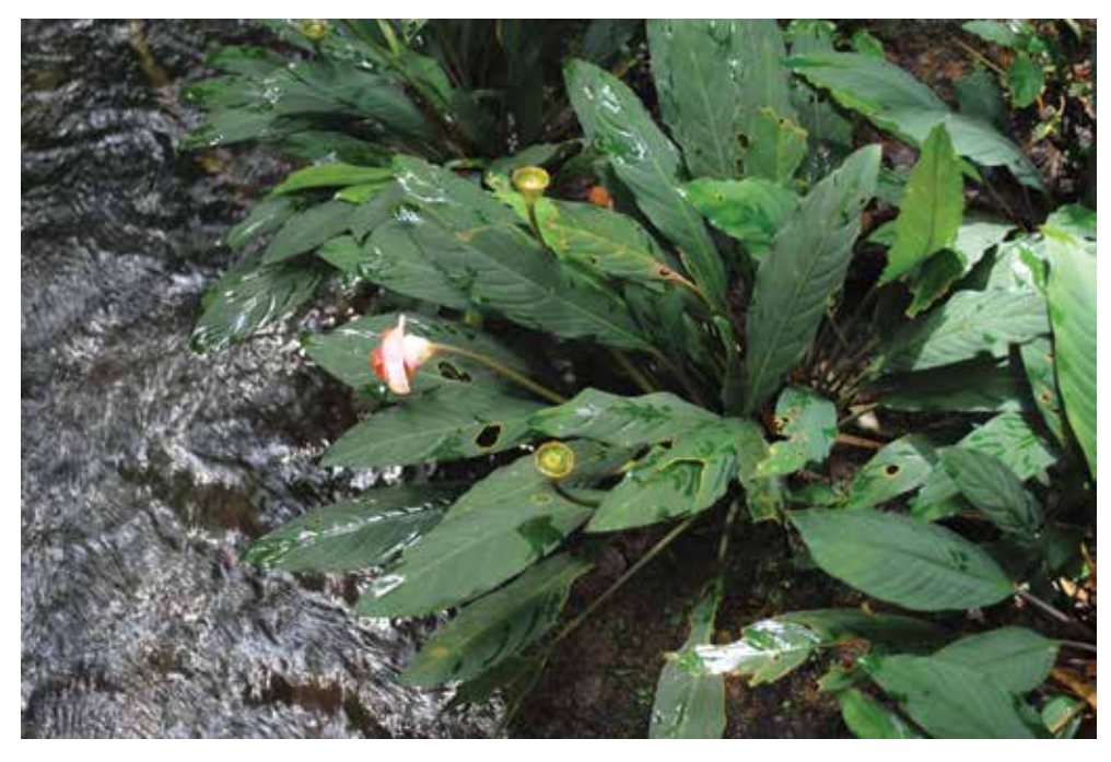
Fig. 3. Steenisian rheophyte. Rhynchopyle viridistigma at late anthesis, plants growing on basalt rocks just above average low-water level. (Photo: P.C. Boyce).