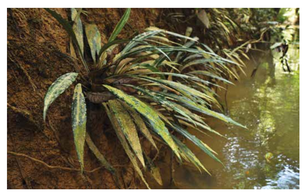
Fig. 4. Steenisian rheophyte. Schottariella mirifica population at the average daily high-water level, growing in deep alluvial mud and anchored by deep tap-roots. Note the leaf blades with copious cryptogams and silt-deposition left by receding spate high water.