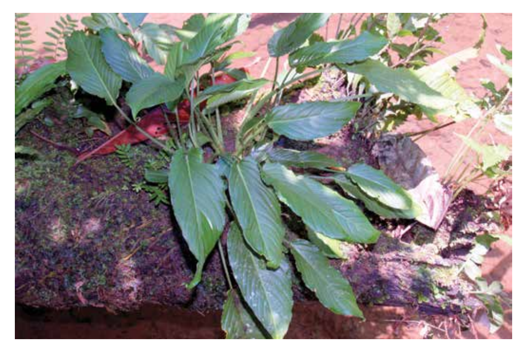
Fig. 9. Heterodox rheophyte. Schismatoglottis ahmadii on coarse-grained sandstone photographed during dry weather; in stormy weather the plants are submerged by up to 1m of fast-moving water. (Photo: P.C. Boyce).