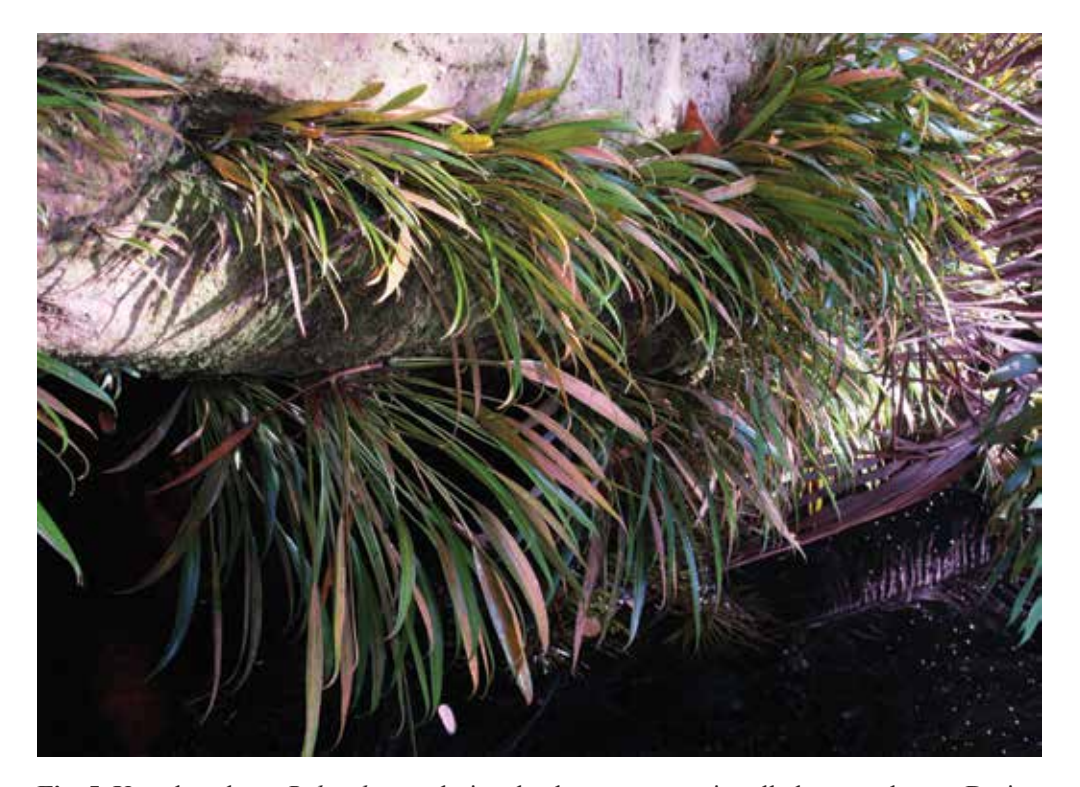
Fig. 5. Xerorheophyte. Bakoa lucens during the dry season on virtually bare sandstone. During wet weather this is a waterfall. (Photo: P.C. Boyce).