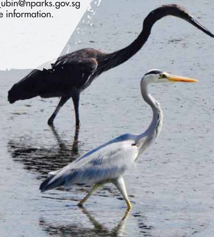
Great-billed Heron ( Ardea sumatrana ) Grey Heron ( Ardea cinera )

Join us as an Ubin volunteer or email us at nparks_pulau_ubin@nparks.gov.sg for more information.