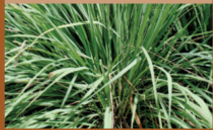
Lemon Grass Cymbopogon citratus