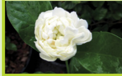
Rose Jasmine Jasminum sambac 'Grand Duke of Tuscany'