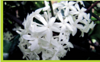
Kanwene Pleiocarpa mutica