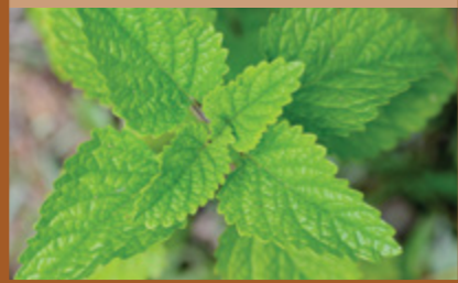
Lemon Balm Melissa officinalis