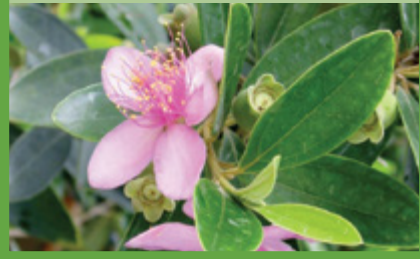
Rose Myrtle Rhodomyrtus tomentosa